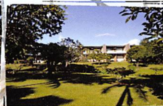
20 minutes drive from the competition site