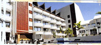
15 minutes walk from the competition site