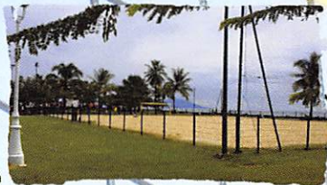
4 official courts in the gardens of Paofai