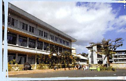
Boarding school Breakfast & dinner

10 minutes walk from the competition site