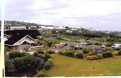
Boarding school Breakfast & dinner Bus rotation every 20 min

10 minutes drive from the competition site